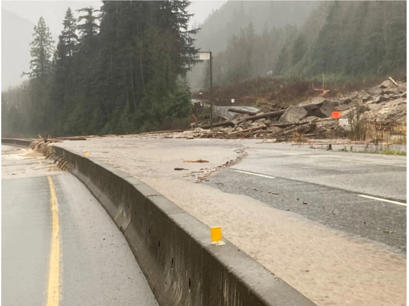
A view of the Coquihalla Highway following mudslides and flooding in British Columbia, Canada, November 14, 2021

Officials in Merrit, British Columbia, order residents to leave as floodwaters 'inundated two bridges' and forced waste water treatment plant to close.