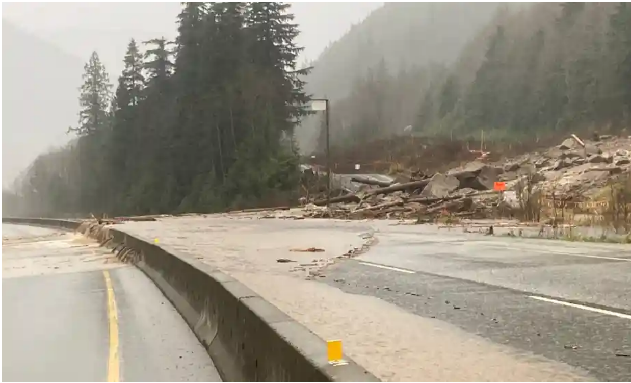
A view of the Coquihalla Highway following mudslides and flooding in British Columbia, Canada, on Sunday.