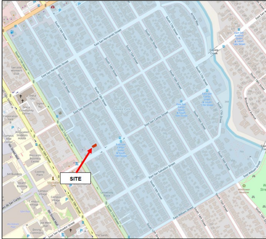
Naglee Park Conservation Area