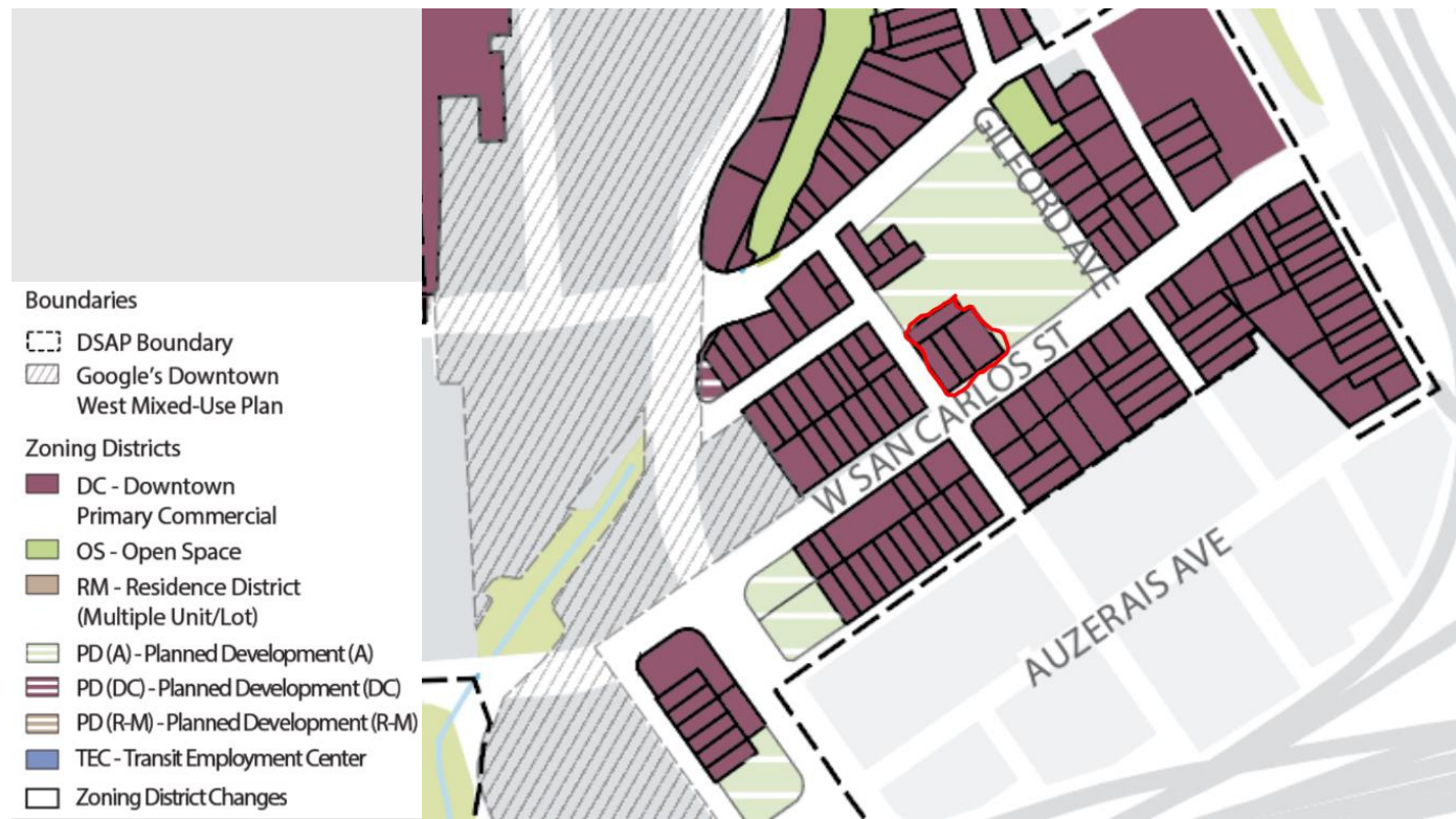
Figure 3: Proposed Zoning Map

The proposed project conforms with Table 20-270 , Section 20.120.110 of the San José Municipal Code, which identifies the DC Downtown Primary Commercial Zoning District as a conforming district to the General Plan Land Use/Transportation Diagram land use designation Downtown.