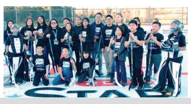
WELCOMING SAN JOSÉ PLAN 2.0

social fabric of the San José community.