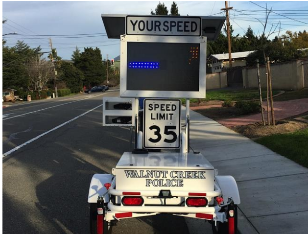
Mobile - Stationary