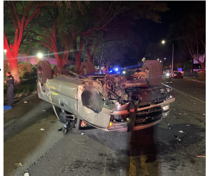
Photo from Sideshow/street race on March 12, 2021