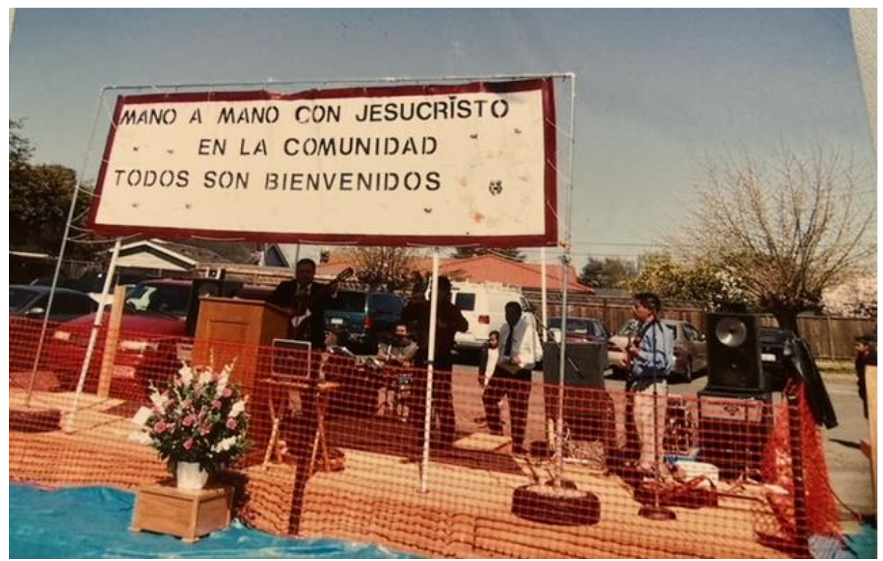
"There is no power of change greater than a community discovering what they care about"