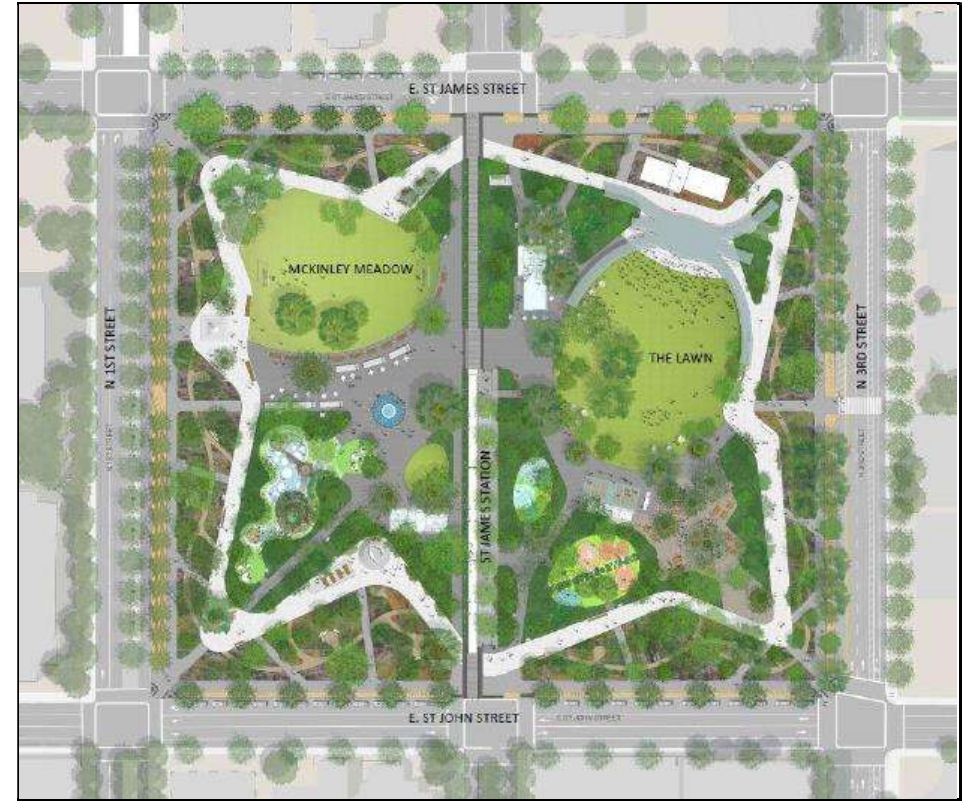
Figure 2: Proposed St. James Park Master Plan

Please refer to Figure 2 below for the proposed St. James Park Capital Vision and Levitt Pavilion Project (St. James Park Master Plan).