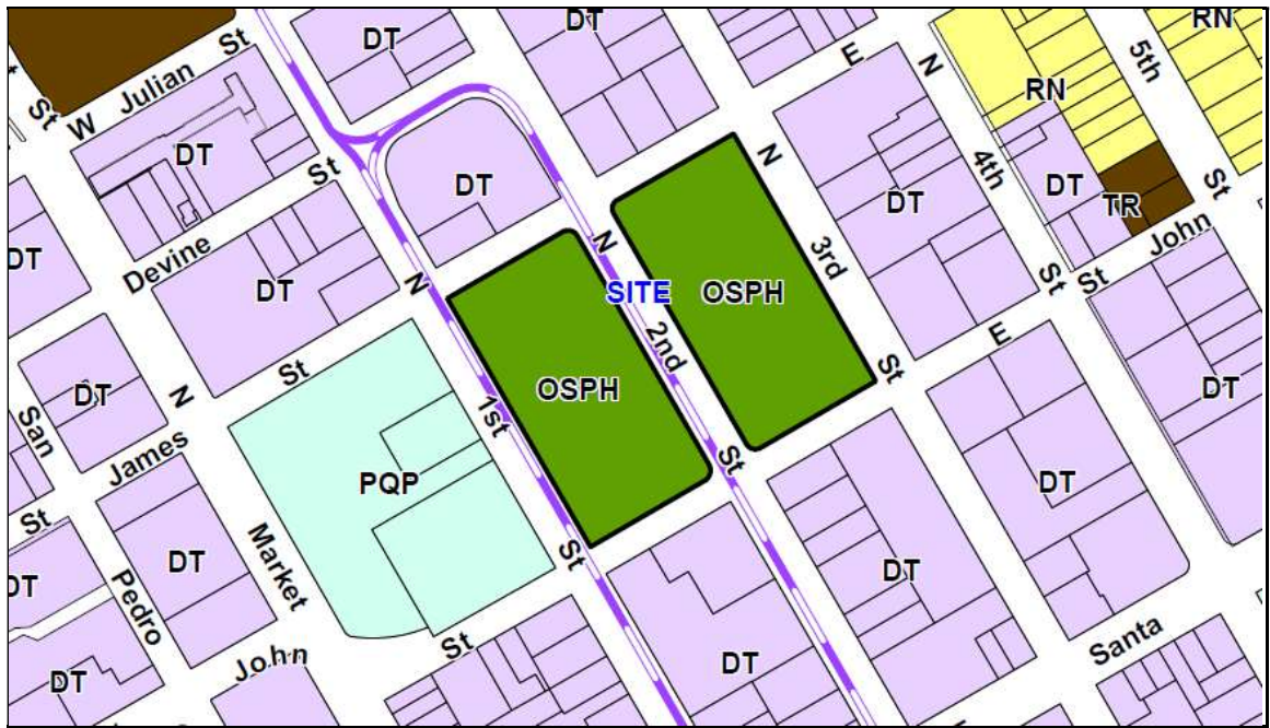
Figure 3: General Plan Map

Additionally, the proposed project generally supports the following goals and policies of the General Plan with respect to designated historic districts. St. James Park would continue to represent important patterns of early San José based on its use, location, and interpretive elements and the project preserves the essential form and integrity of the park's history.