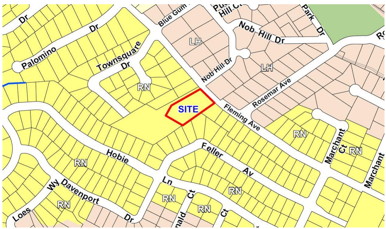
Figure 2: General Plan Land Use/Transportation Diagram

The Residential Neighborhood designation is applied broadly throughout the City to encompass most of the established, single-family residential neighborhoods, including both the suburban and traditional residential neighborhood areas. The intent of this designation is to preserve the existing character of these neighborhoods and to strictly limit new development to infill projects which closely conform to the prevailing existing neighborhood character as defined by density, lot size and shape, massing and neighborhood form and pattern. The average lot size, orientation, and form of new structures for any new infill development must therefore generally match the typical lot size and building form of any adjacent development, with particular emphasis given to maintaining consistency with other development that fronts onto a public street to be shared by the proposed new project.