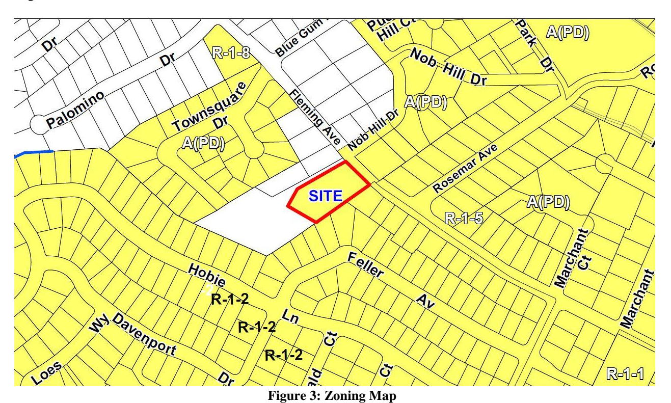
The R-1-8 Single-Family Residence Zoning District would allow the property to be used and developed in accordance with the allowable uses in Table 20-50, including single-family residential residences with an allowed density range from one to eight dwelling units per acre. The property is currently undeveloped, and no development applications are currently on file for this site.

The project proposes annexation of the approximately 0.99 gross acres of unincorporated Santa Clara County to the City of San José, including detachment from the Central Fire Protection District, County Sanitation District 2-3, and Santa Clara County Library Services. Upon completion of the annexation proceedings, the subject site would be eligible to connect to City infrastructure and services, and the aforementioned R-1-8 zoning would be effective.