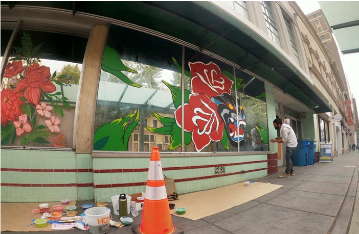
A corner of Downtown gets a fresh look, thanks to Hella Gardens

The program to showcase the artistic diversity of San Jose was organized by Local Color and supported by the City of San Jose and San Jose Downtown Association. Read the blogpost for more details and images.