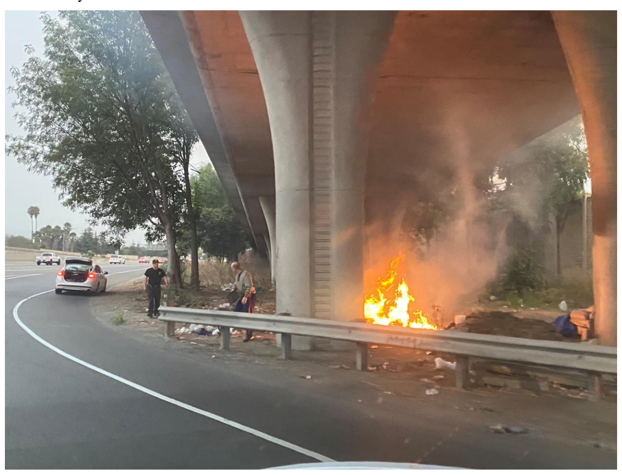
Fire near Story Road and 101, September 9, 2020

beautifying our communities, blight can pose serious dangers to our residents, as illustrated below, by this photo taken by a community member last week near Story Road and 101, and negatively impact the ecological environment of our many federally protected species within all waterways.