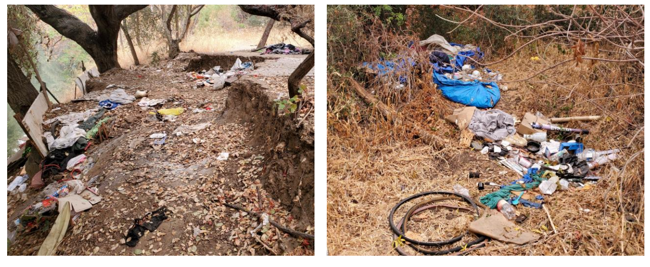
Guadalupe River, September 11, 2020 -Illegal dumping and encampment remnants