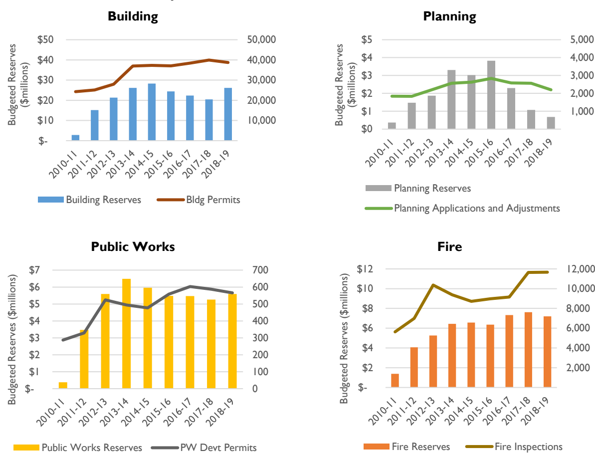
Exhibit 4: Development Partners' Reserves Grew with Workload<sup>7</sup>

Source: Auditor analysis of Budget documents and data provided by departments for the City's Auditor's Annual Services Report