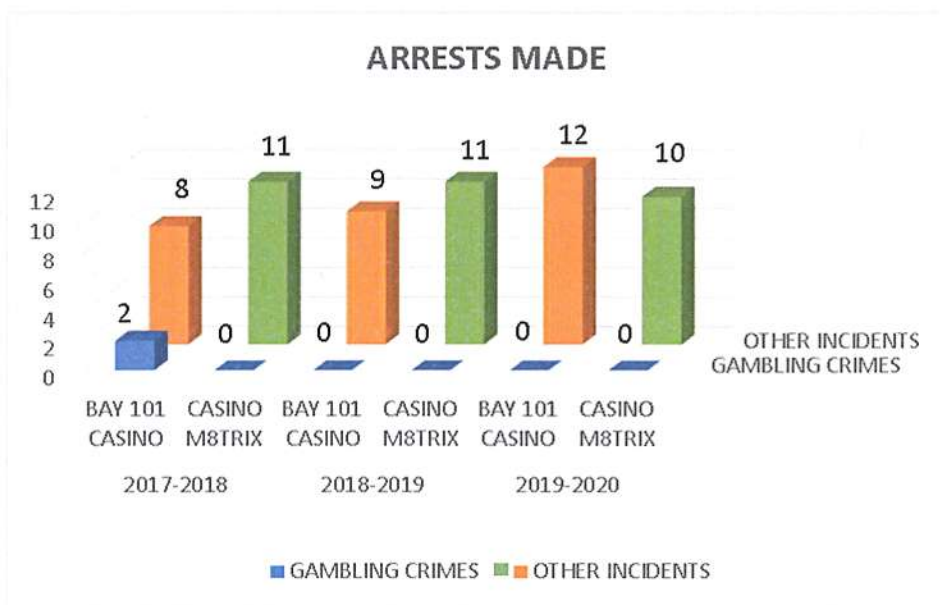
Figure 3: COMPARISON, REPORTED INCIDENTS WITH ARRESTS MADE Comparison of total calls for service from Fiscal Years 2017-2018 through 2019-2020 Gambling Crimes and Other Incidents

Figure 3 shows that in Fiscal Year 2019-2020, that Bay 101 Casino experienced an increase of three (3) arrests and Casino M8trix experienced a decrease of one (1) arrest from the prior fiscal year.