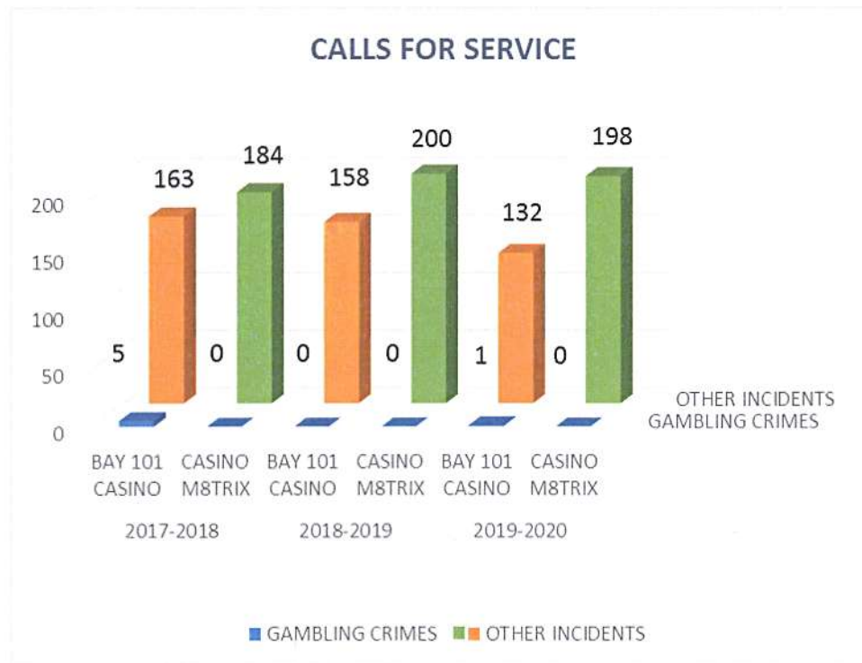
Figure 1: COMPARISON, CALLS FOR SERVICE Comparison of total calls for service from 2017-2018 through 2019-2020 Gambling Crimes and Other Incidents

The above chart shows that for Fiscal Year 2019-2020, Bay 101 Casino experienced a decrease of twenty-five (25) calls for service and Casino M8trix experienced a decrease of two (2) calls for service from the prior fiscal year.