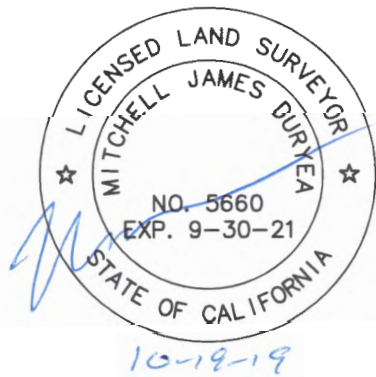
EXHIBIT "B" PLAT TO ACCOMPANY THE LEGAL DESCRIPTION OF KNOX AVENUE STREET DEDICATION SAN JOSE, CA SHEET 2 OF 2