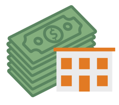
Ability to Pay