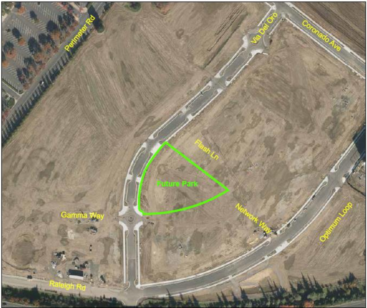
ISTAR/GREAT OAKS FUTURE PARK SITE LOCATION MAP