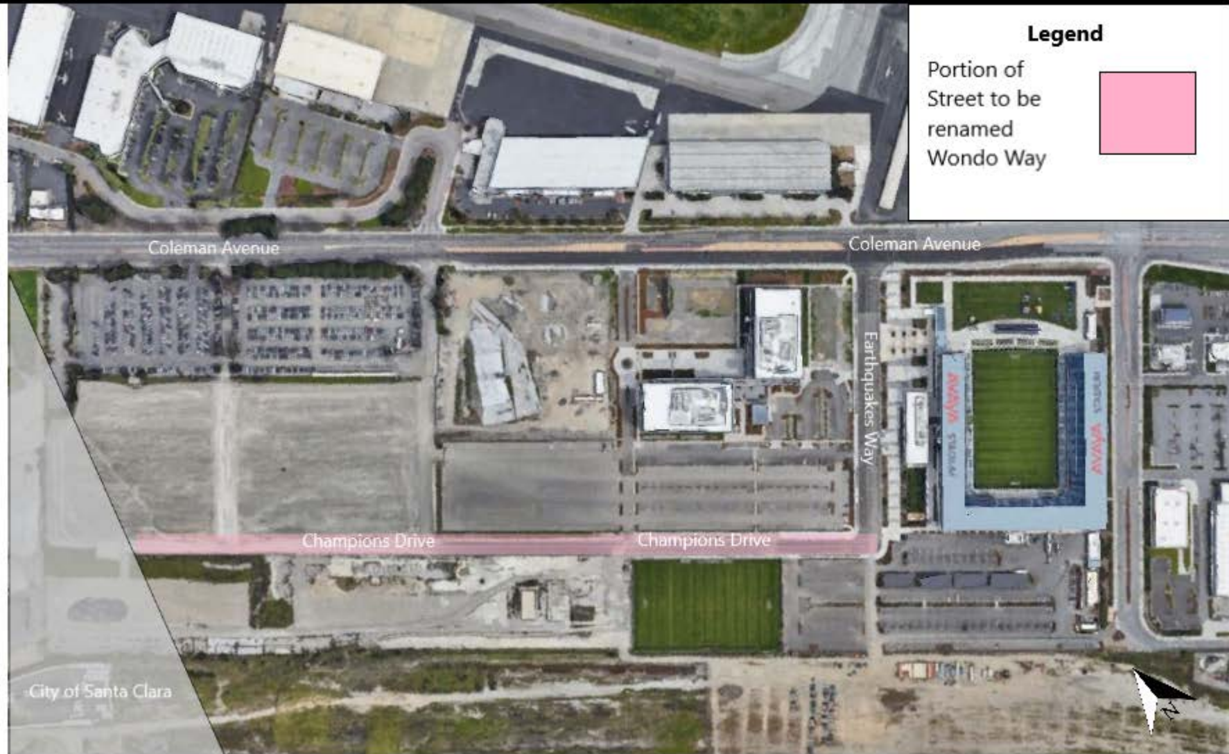
Exhibit A: Street Renaming (File No. ST20-001)