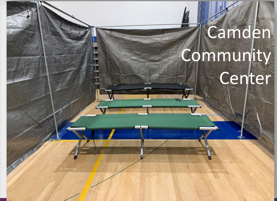
Camden Community Center