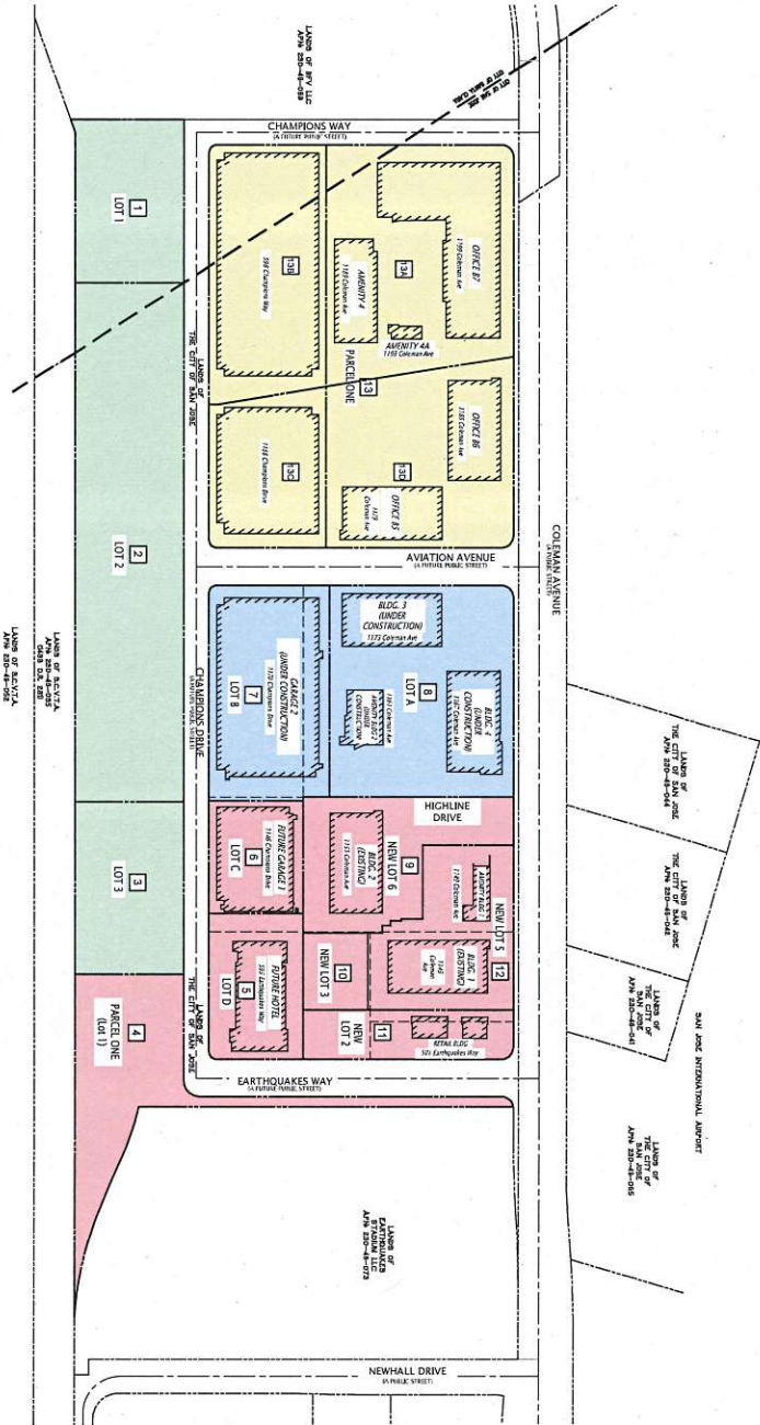
EXHIBIT A - SITE MAP