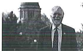
ROGER MILLAR Secretary of Transportation Washington State Department of Transportation

7:45 am - 5:00 pm Registration 8:00 am - 10:15 am Breakfast & Welcome Keynote