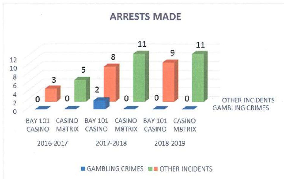
Figure 3: COMPARISON, REPORTED INCIDENTS WITH ARRESTS MADE Comparison of total calls for service from Fiscal Years 2016-2017 through 2018-2019 Gambling Crimes and Other Incidents

Figure 3 shows that in Fiscal Year 2018-2019, there was a total of nine arrests made at Bay 101 Casino, with none being a gambling crime; and a total of eleven arrests made at Casino M8trix with none being a gambling crime.