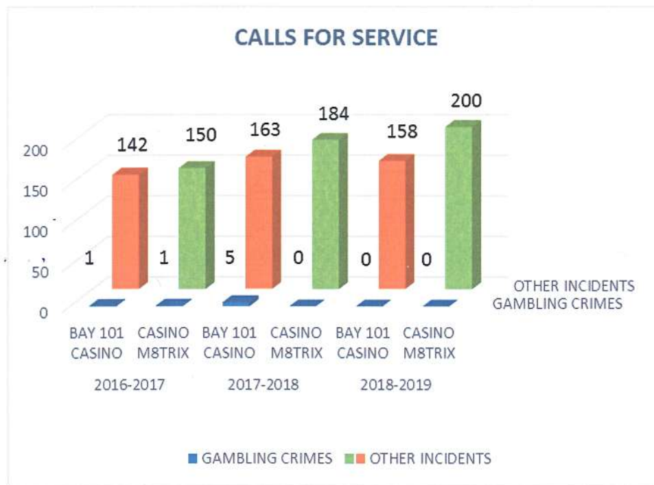
Figure 1: COMPARISON, CALLS FOR SERVICE Comparison of total calls for service from 2016-2017 through 2018-2019 Gambling Crimes and Other Incidents

The above chart shows that for Fiscal Year 2018-2019, Bay 101 Casino had one hundred fifty-eight calls for service. Of those calls for service, nine resulted in arrests at Bay 101 Casino with none being a gambling crime.