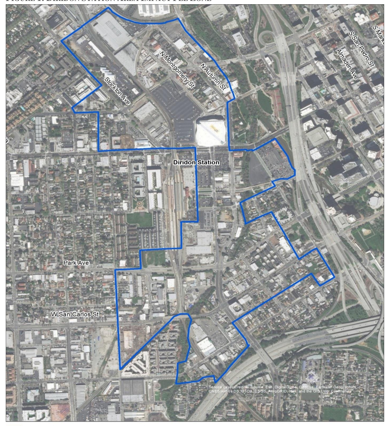
FIGURE 1: DIRIDON STATION AREA IMPACT FEE ZONE