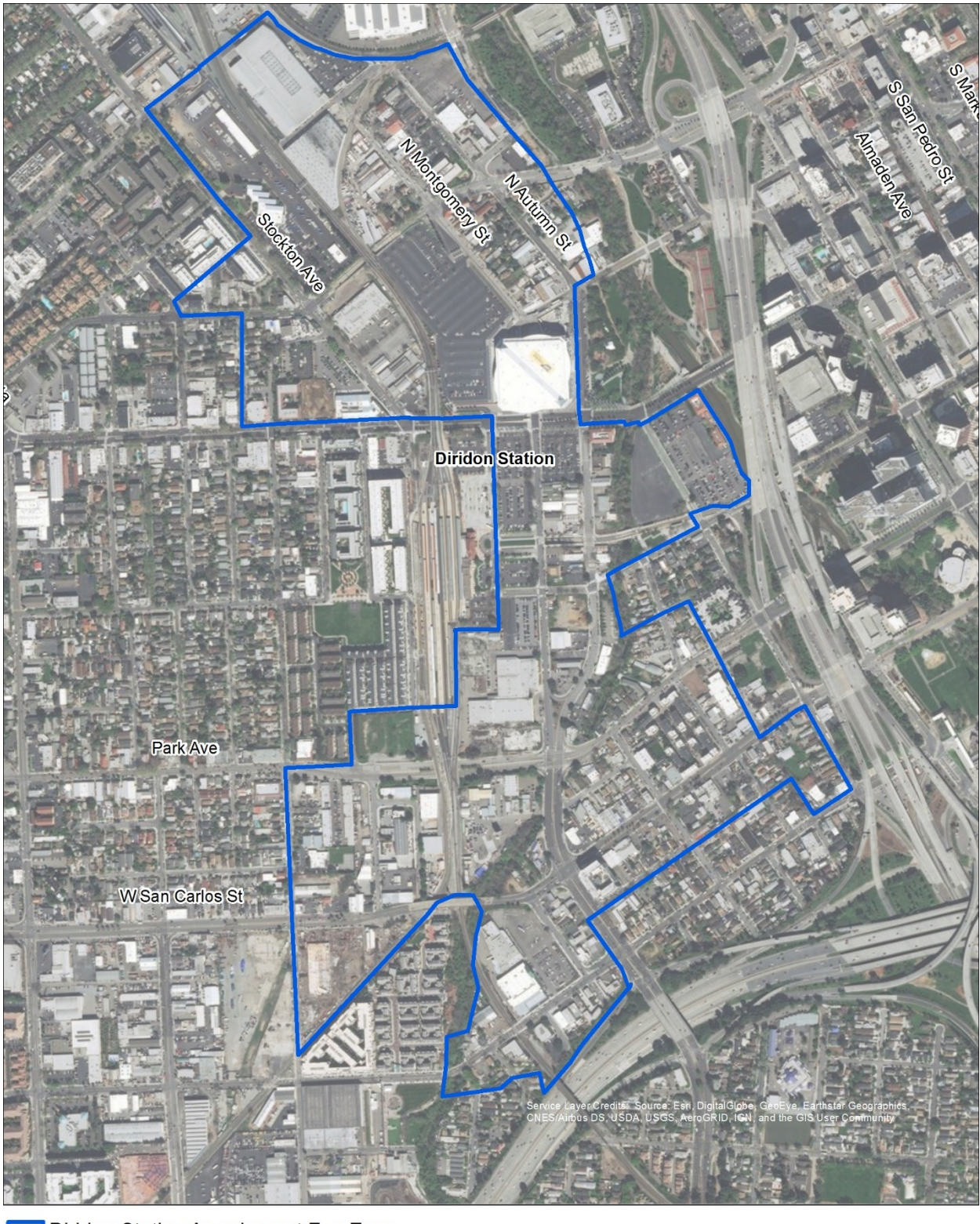
FIGURE 5: DIRIDON STATION AREA IMPACT FEE ZONE