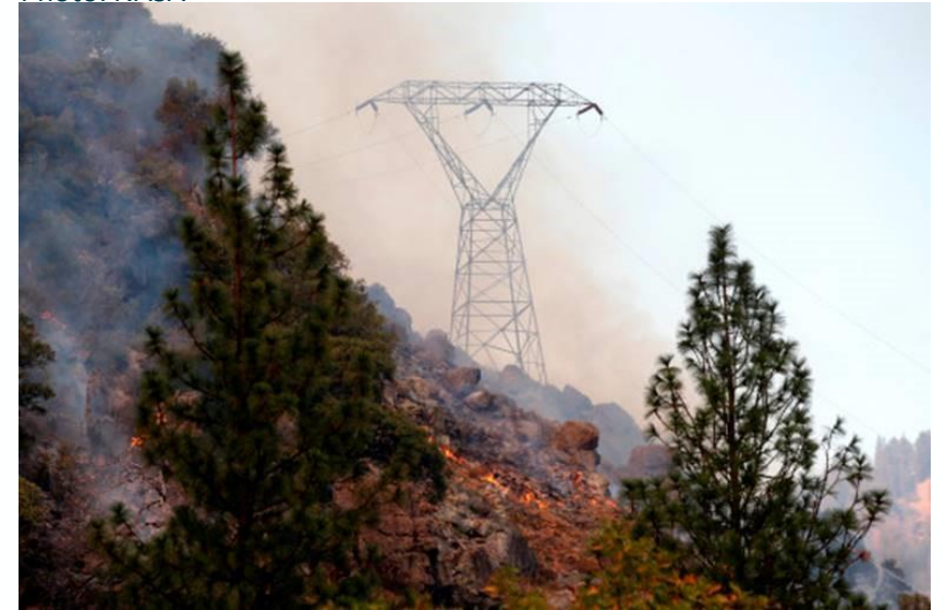
Paradise, CA; November 9, 2018