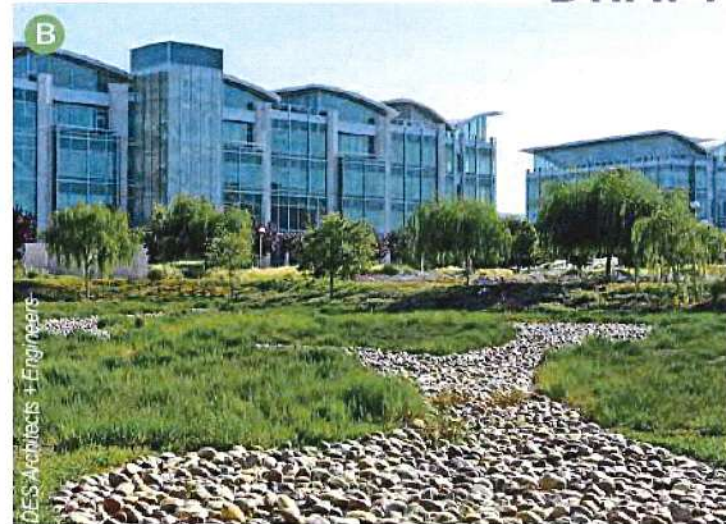
Example of Regional Treatment Facility when Dry at Pacific Shores Center in Redwood City, California