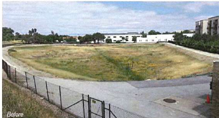
Conceptual Rendering - River Oaks Pump Station Facing West