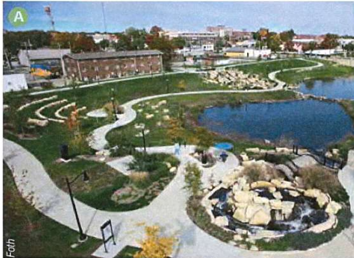
Example of Regional Stormwater Treatment Integrated into Park Setting at Helms Park in Champaign, Illinois