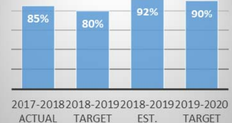
% of Parents and Caregivers who Report Reading More to Their Children Following Participation in a Library Program or Activity