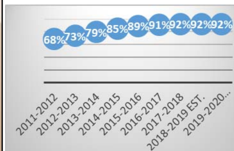
Animal Care Center Live Release Rate