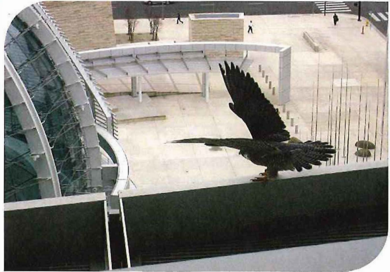
Peregrine Falcon at San José City Hall

Designing a bird-friendly building does not have to add to the cost of construction. Retrofitting an existing building can often be done by simply targeting problem areas. Consider bird-friendly best practices early on in project development to meet your project budget and demonstrate environmental leadership.