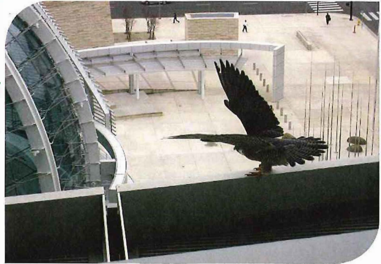
Peregrine Falcon at San José City Hall