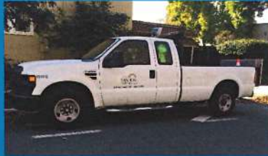
1 Pickup Truck with Lift Gate