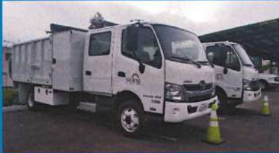
3 Leaf Body Trucks