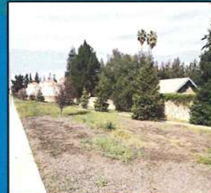
Guadalupe Pkwy (Before & After)