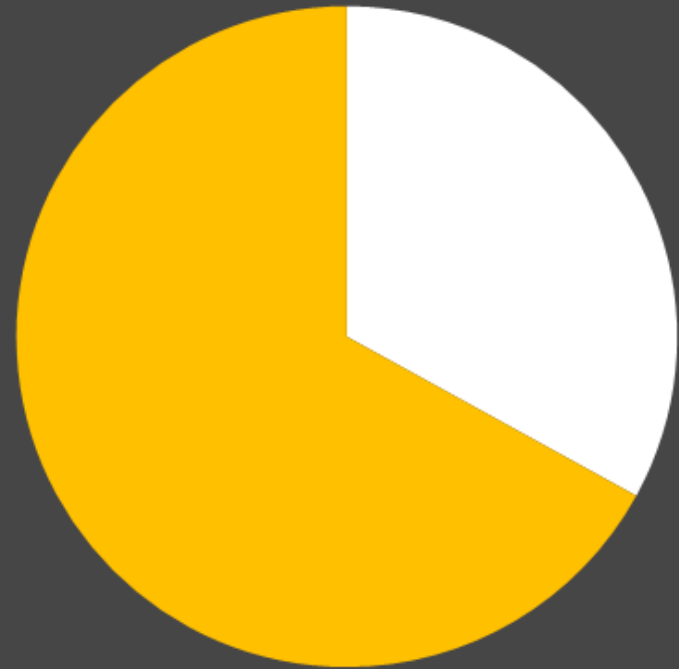
Children in Poverty