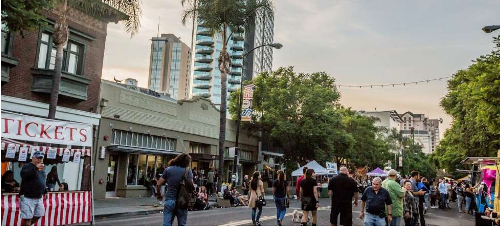
San Jose's SoFA District

T his package is designed to give you some familiarity with San Jose's Opportunity Zone portfolio and existing community assets. But it's not the best way to understand the possibilities. For that, you'll need to walk the neighborhoods, shop in the community, and talk to neighbors, employers, and community advocates. These Zones include diverse places in terms of real estate and population. They encompass an urban downtown, suburban office parks, heavy manufacturing districts as well as key small business corridors that serve diverse ethnic communities.