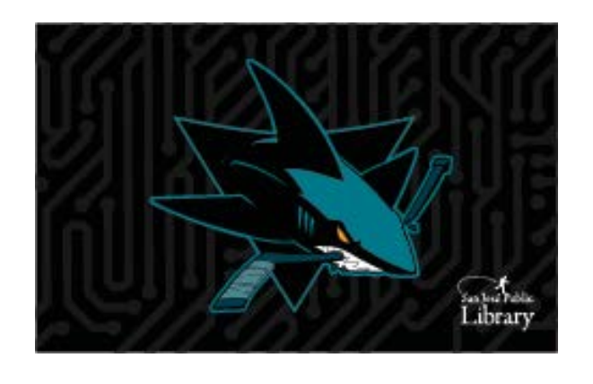
Library Card Campaign