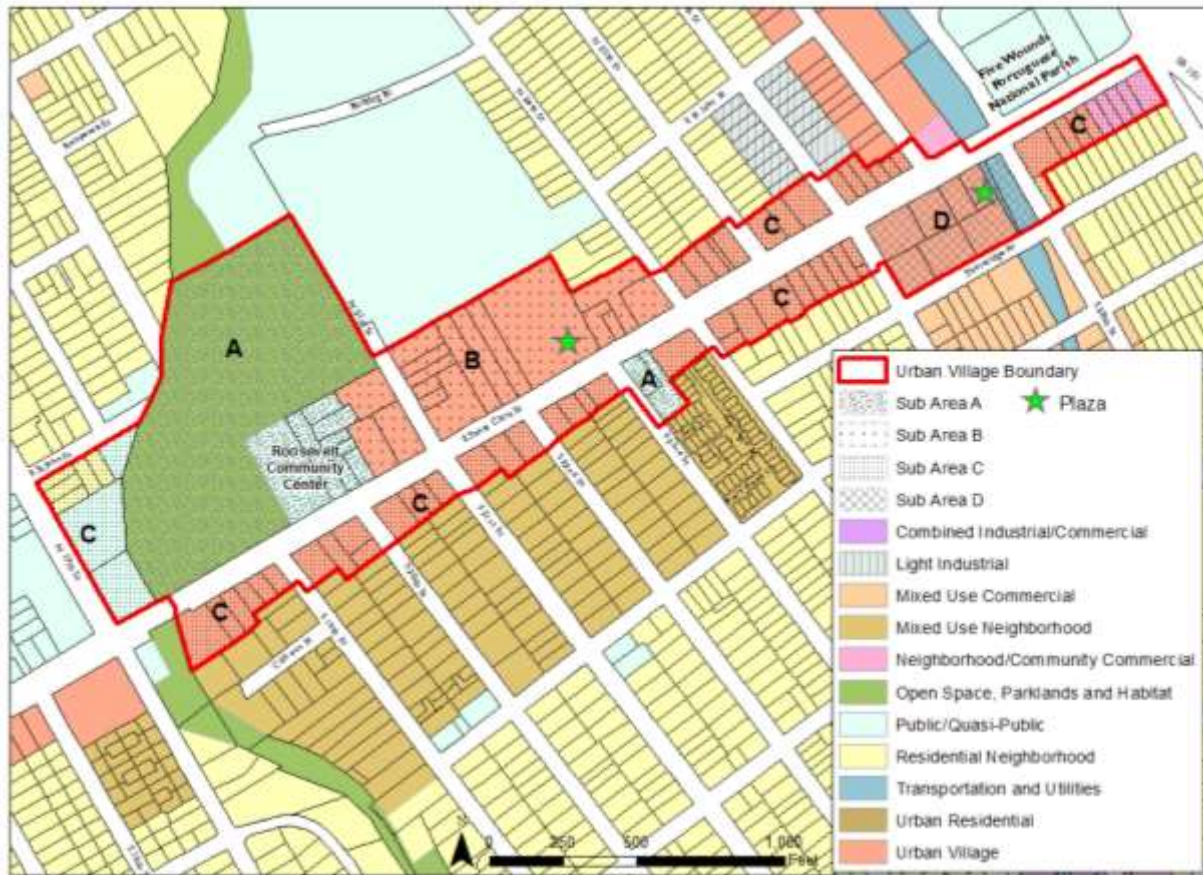
Figure 1 Roosevelt Park Village Land Use Plan