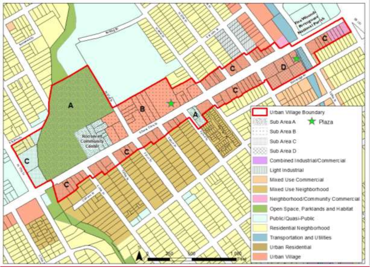
Figure 1 Roosevelt Park Village Land Use Plan