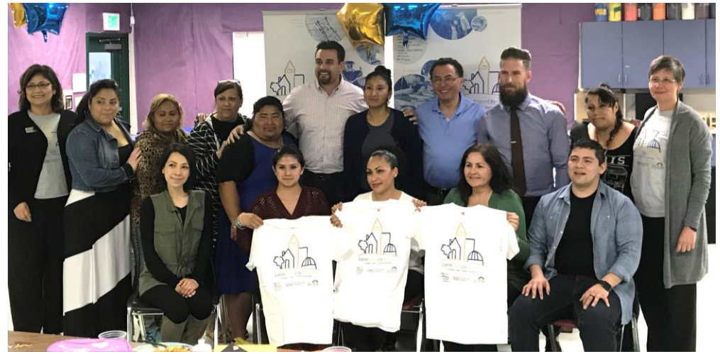
2017 Community Leadership Program Graduation Ceremony

100% of participants indicated they feel more responsibility for being a leader in the community and plan to utilize the information they learned to improve their communities.