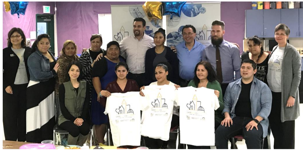
2017 Community Leadership Program Graduation Ceremony

100% of participants indicated they feel more responsibility for being a leader in the community and plan to utilize the information they learned to improve their communities.