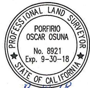
EXHIBIT B - PLAT MAP LANDS OF MONTANEZ 1298 MICHIGAN AVE