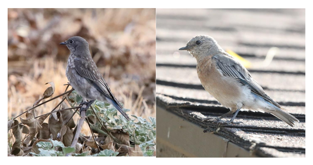
Figure 8. Fledgling western bluebird (left) watched by adult female (right) near the proposed project site on 25 August 2018.