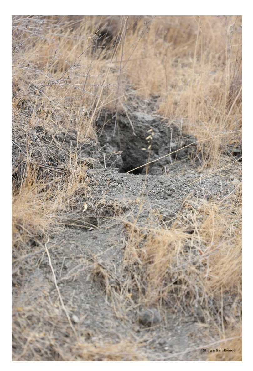
Figure 12. A ground squirrel burrow on the proposed project's border, observed on 25 August 2018. Such burrows are used as breeding and refuge habitat by burrowing owls.