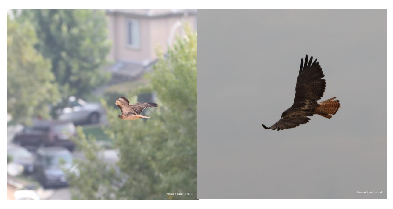
Figure 4. A red-tailed hawk seen against a residential background (left photo) and after having begun soaring (right photo) just northeast of the proposed project site on 25 August 2018. I also saw two red-tailed hawks forage together over the proposed project site, both soaring and kiting.