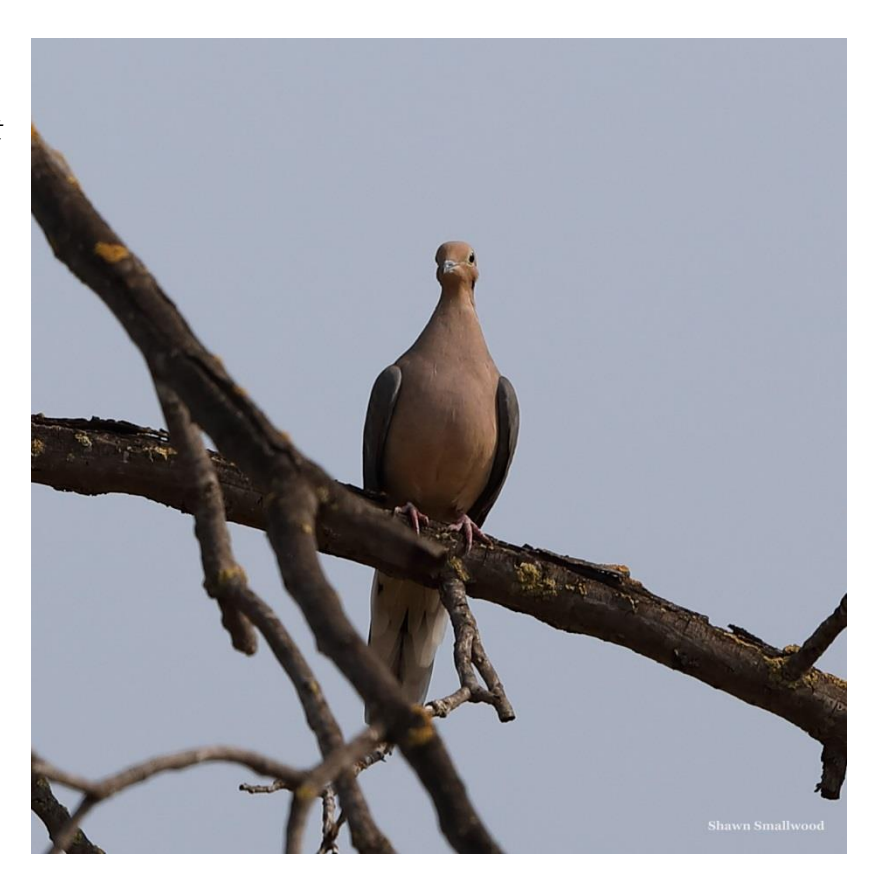
Figure 10. One of many mourning doves on and nearby the proposed project site on 25 August 2018.