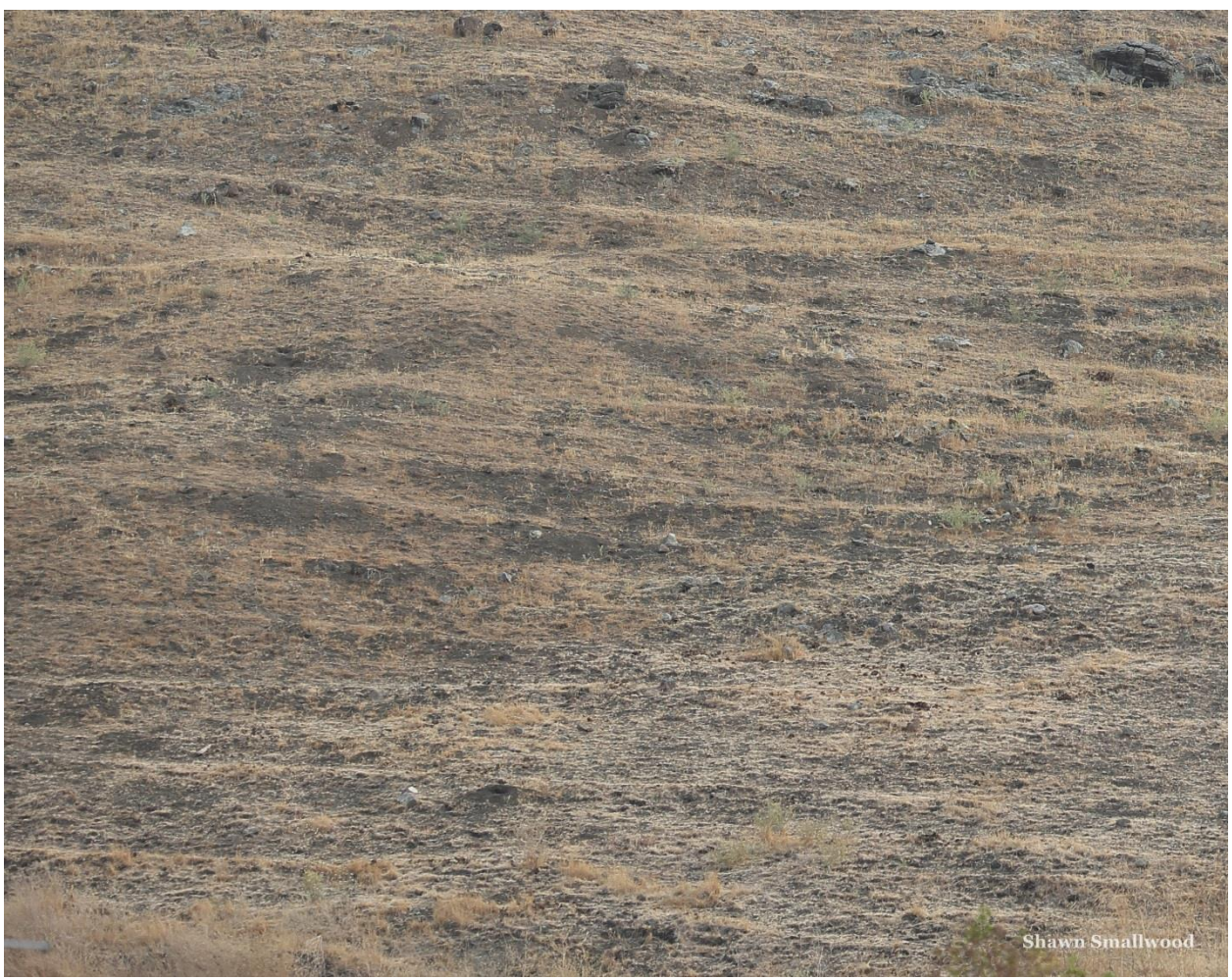
Figure 11. At least 15 ground squirrel burrows are visible in this photo frame on the proposed project site on 25 August 2018, indicating the presence of a key component of burrowing owl habitat.