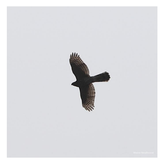
Figure 3. Cooper's hawk having just left the proposed project site, 25 August 2018. I also saw this or another Cooper's hawk at the intersection of Hassler Parkway and Trestlewood Drive and just north of the north end of Thornberry Lane.