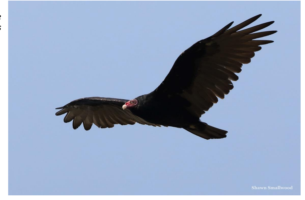
Figure 5. One of multiple turkey vultures foraging over and around the proposed project site on 25 August 2018.