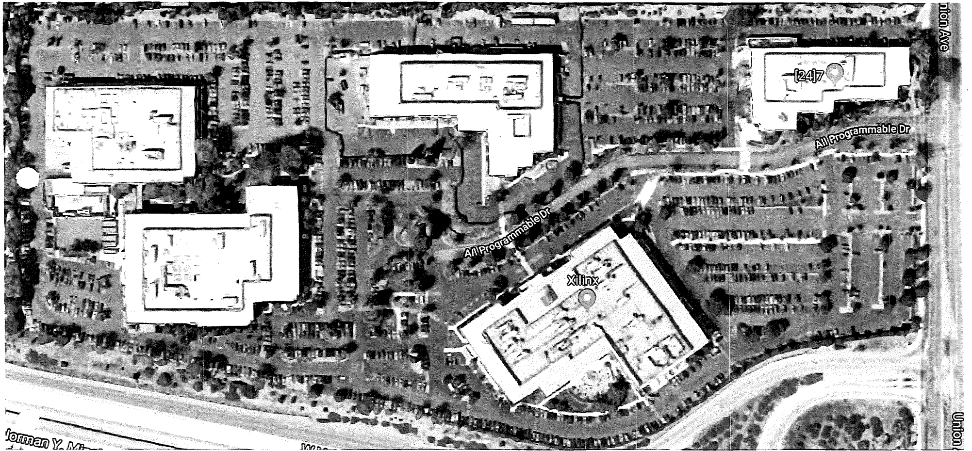
Exhibit "A" File No. ST18-004