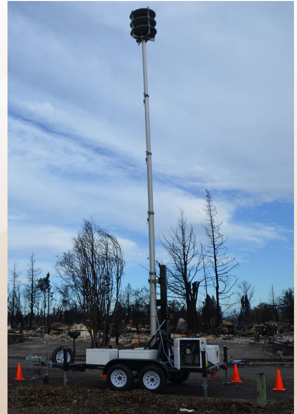
Long-Range Acoustical Device (L-RAD)