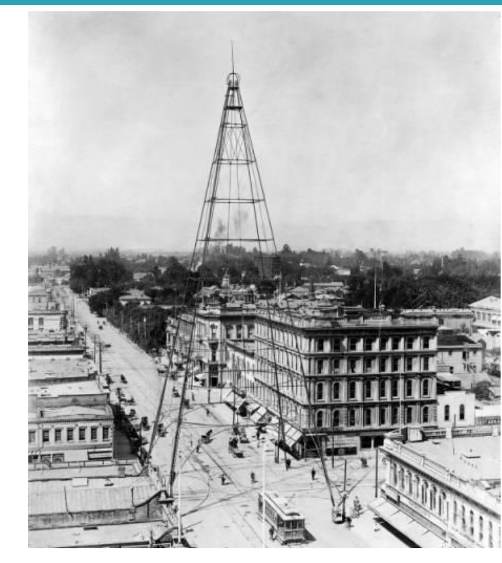
Historic San Jose Light Tower circa 1900. The SJLTC Project will Pay Homage to this Concept