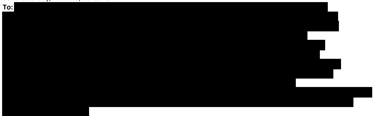
Subject: Re: Opposed to proposed Section 8 and voucher mandate

From: Cheryl [mailto: Sent: Saturday, March 3, 2018 2:31 PM