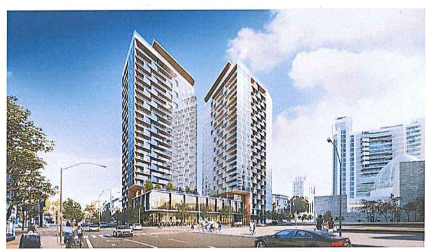
Figure 1 – View from Fourth Street