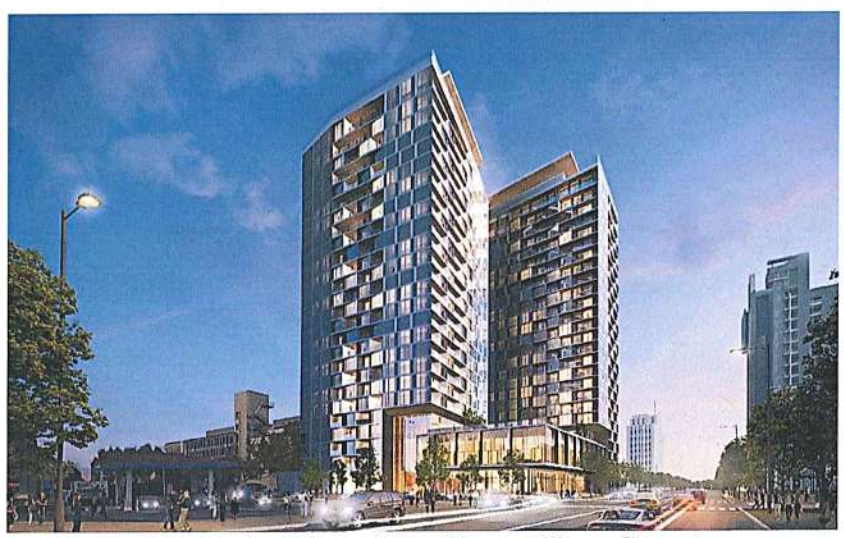
Figure 2 – View down Santa Clara Street