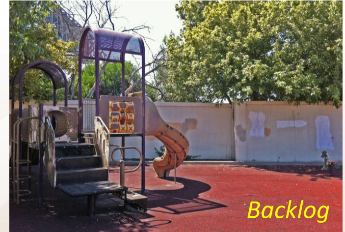
Gregory Tot Lot