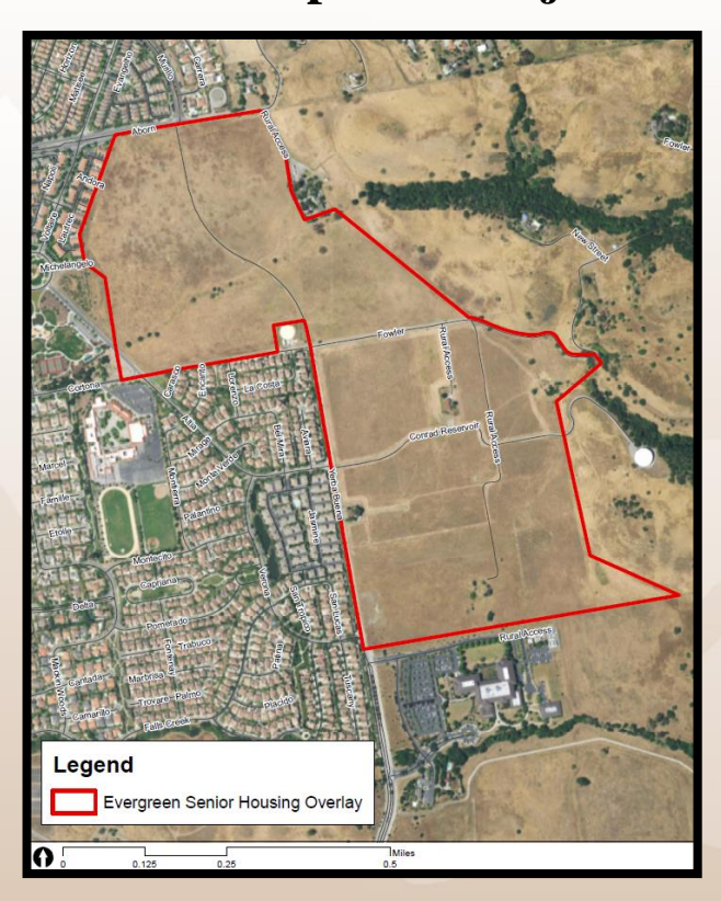
ESH Specific Plan