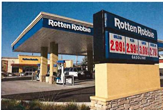
Fig. 1 - 4200 Williams Rd. San José, CA

It is also critical to understand the industry need for diesel refueling sites around industrial sites. There are few to none fueling stations in San Jose that caters specifically to trucks and there are few sites in the area that would be able to properly support such a business. The subject site, which has existed as a fueling station for the past 52 years, would continue that use and provide a much needed amenity to trucks servicing the surrounding industrial properties.