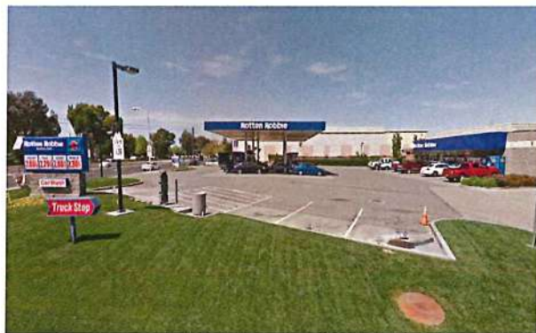
Fig. 2 - 3471 Lafayette St. Santa Clara, CA

Furthermore, a 3,750 sq. ft. convenience store would be a positive amenity for the neighborhood providing food and retail necessities. Similar examples to this proposed project can be found at the recently built 3,200 sq. ft. project on 4200 Williams Road in San José ( Fig. 1 ) and at the 3,250 sq. ft. convenience store at 3471 Lafayette St. in Santa Clara ( Fig. 2 ). As seen in the images above, the sites are well-kept, aesthetically pleasing and improves the quality of the surrounding community.