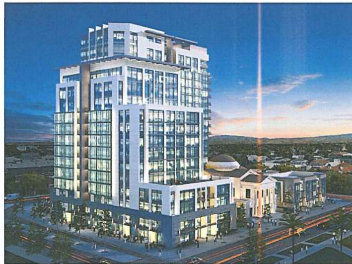
Figure 4 – View at First and St. James streets