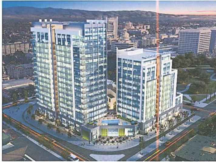
Figure 3 – Aerial View of First and Devine streets