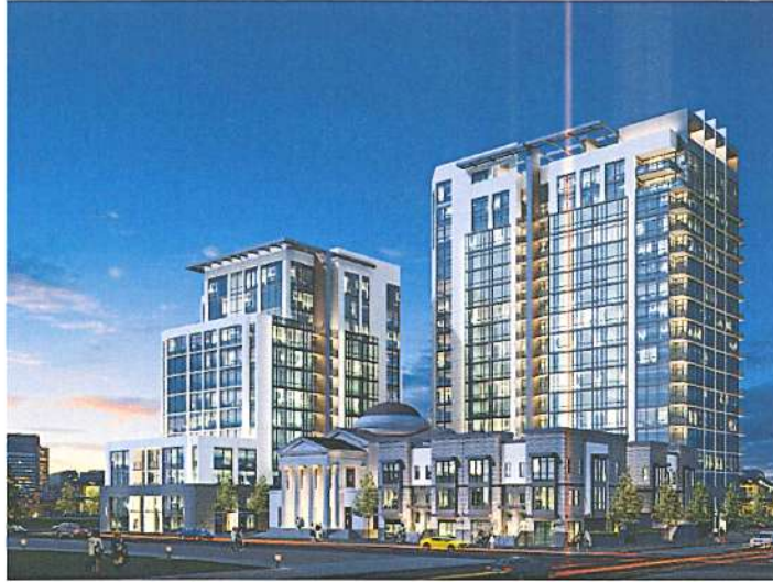
Figure 1 – View at Second and St. James streets