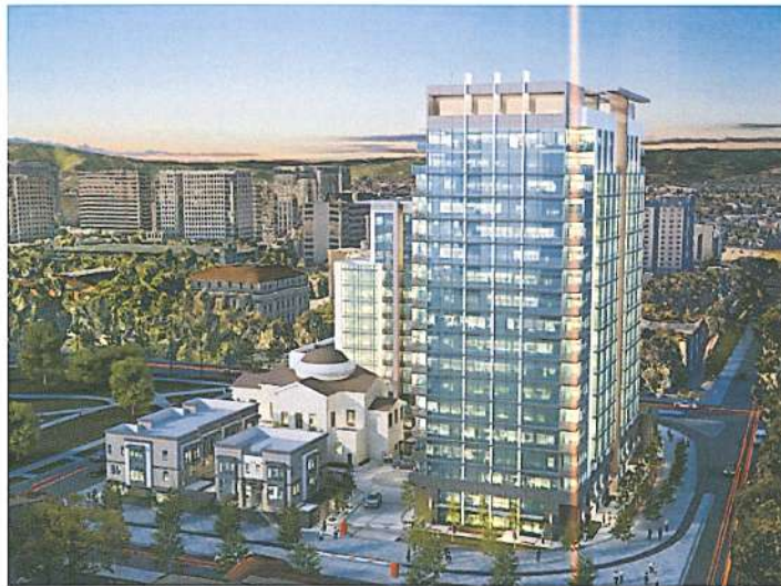
Figure 2 – Arial View on Second Street