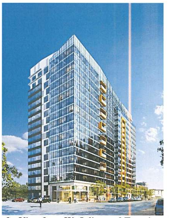
Figure 2 - View from W. Julian and Terraine streets