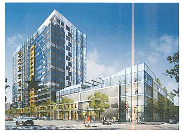
Figure 1 - View on Terraine Street