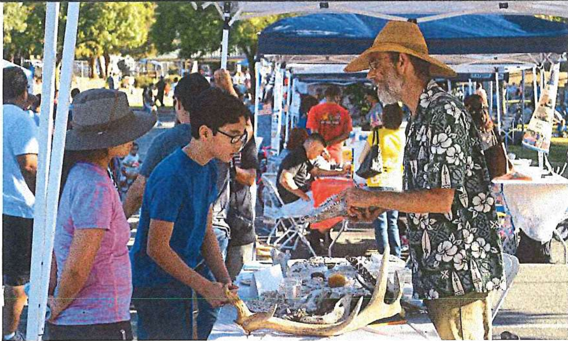
Santa Teresa Foothills Neighborhood Association (STFNA) showcasing local fauna