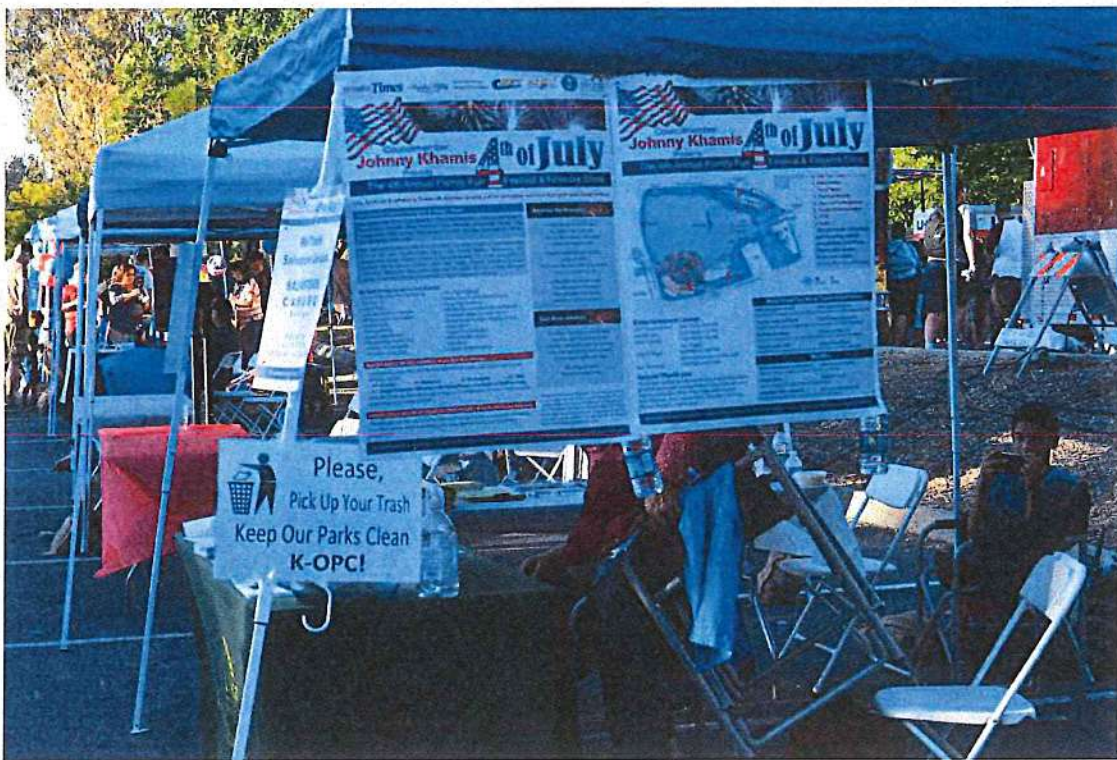
Program signage and clean up reminders