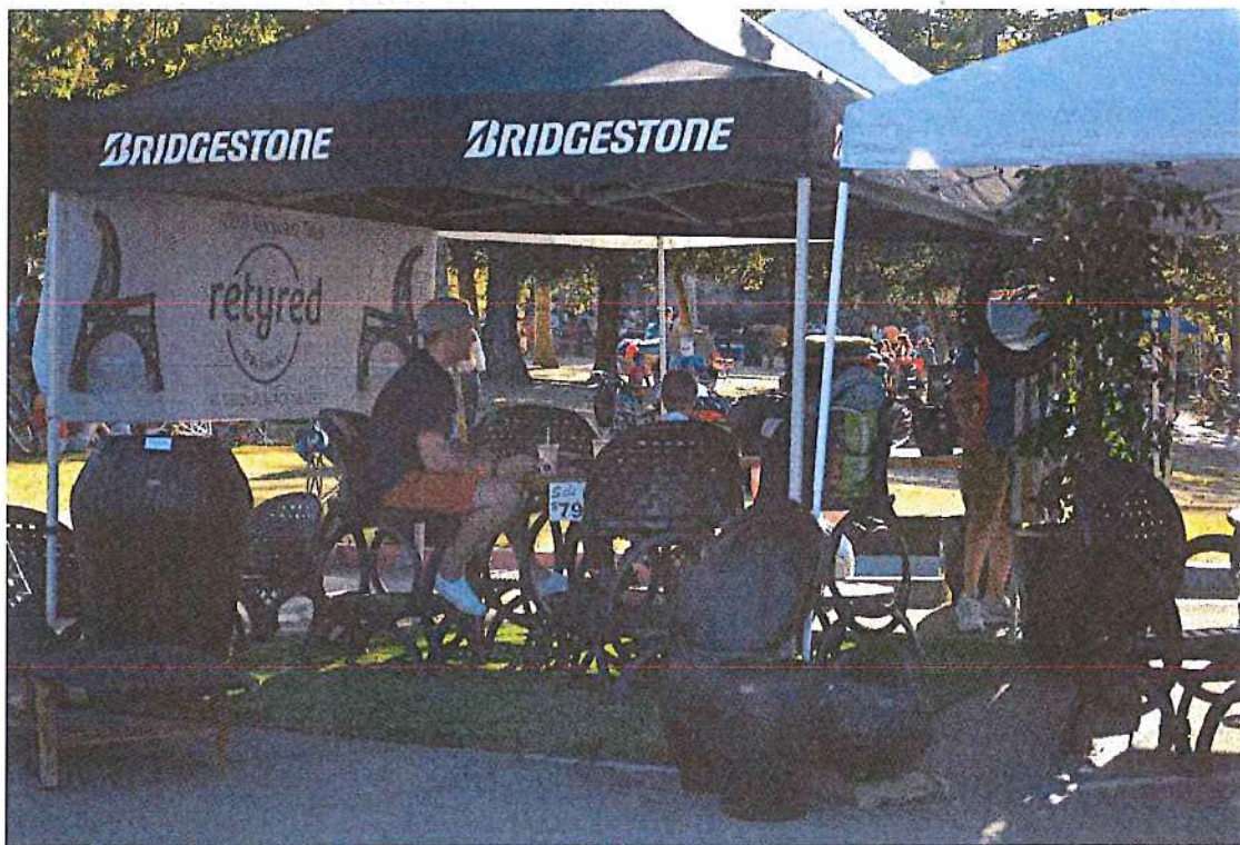
Major Sponsor Skip's Tires showcasing recycled tires as furniture under the trade name "Retyred"

After a short breather, we'll quickly be back to planning the 5th Annual July 4th Family Fun Festival & Fireworks Show . We look forward to seeing you again next year!