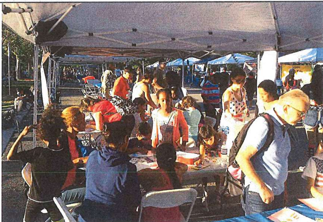
Letters to the Soldiers Booth