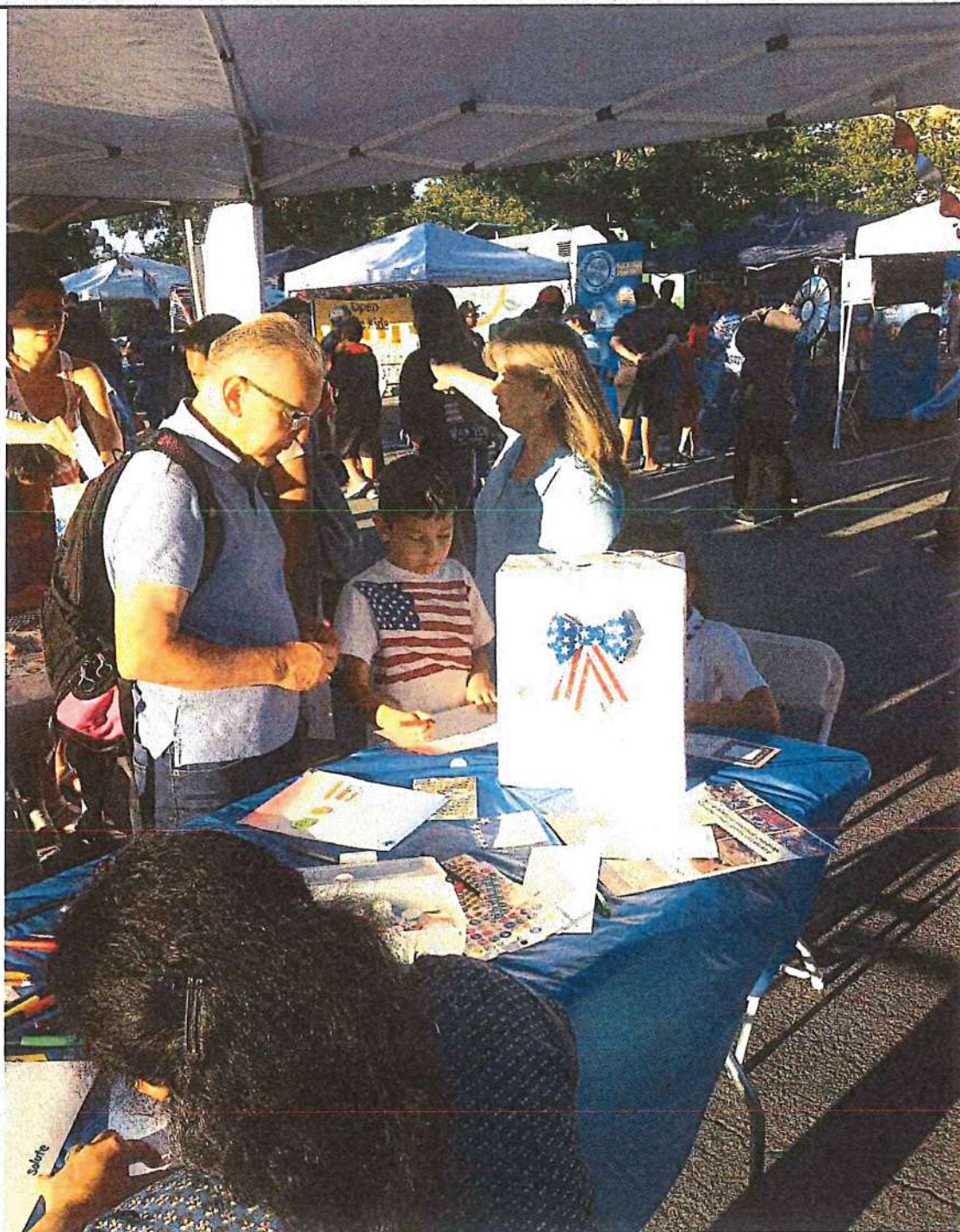
Letters to the Soldiers Table