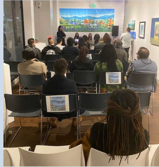
Xank Solidarity Exhibit & Panel