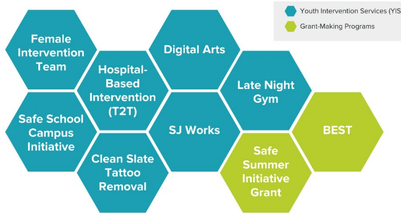
Figure 1: San José Youth Empowerment Alliance Programs