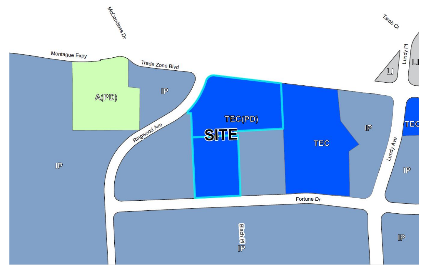
Figure 4 – Proposed Zoning Map

If the proposed rezoning to the TEC(PD) Planned Development Zoning District per File No. PDC22-001 is approved by the City Council, the newly created TEC(PD) Planned Development Zoning District would allow for Data Center uses as well as uses that conform with the TEC Transit Employment Center Zoning District, in alignment with the Transit Employment Center General Plan land use designation. The project would be subject to the applicable Development Standards (Exhibit I) that would be approved upon adoption of the rezoning ordinance. The Planned Development Zoning District allows for data centers and manufacturing uses as a permitted uses with the issuance of a Planned Development Permit.