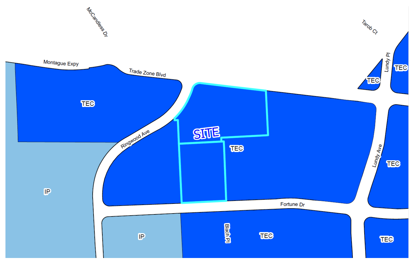
Figure 3 - General Plan Land Use Map